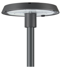
TownTune CPT BDP260