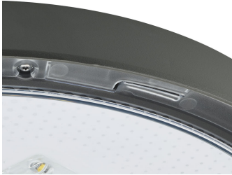
TownTune ASY DR BDP266