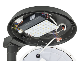
TownTune ASY BDP265