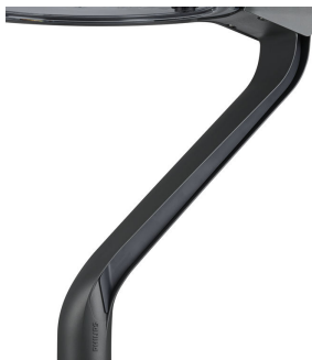
TownTune LYR BDP270