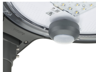
TownTune ASY BDP265