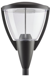
Metronomis 1 LED-BDS570