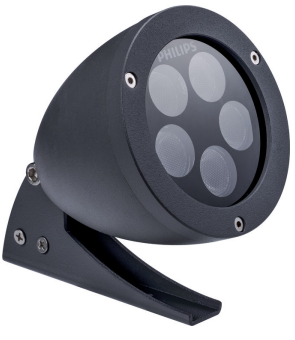
UniPoint BGP312 5LED