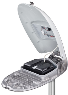
BGP502 Iridium gen4 Medium Open2