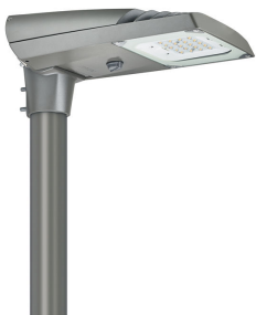
Luma gen2 Micro with SR connector