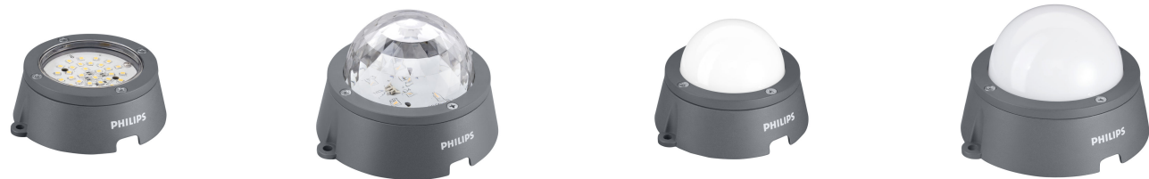
BGS301 G2 CFC