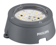
BGS301 G2 CFC