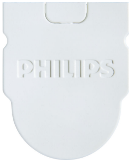
SmartBright LED batten G2 BN012C side