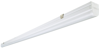
SmartBright LED batten G2 BN012C