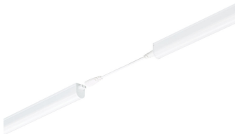
Ledinaire batten, BN021C, Light- line via connection cable