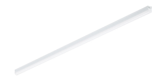
Ledinaire batten, BN021C,