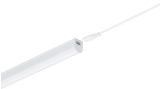
Ledinaire batten, BN021C, Connection