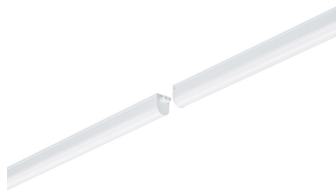
Ledinaire batten, BN021C, Light-line pin-to-pin