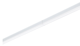
Ledinaire batten, BN021C, Light-line pin-to-pin