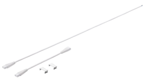
Ledinaire batten, BN021C, Accessories included