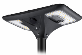
Solar All-in-one Post top