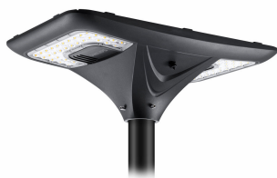
Solar All-in-one Post top