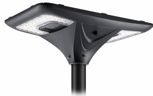
Solar All-in-one Post top