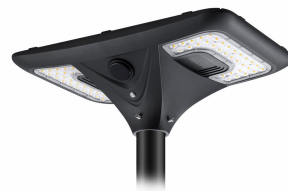
Solar All-in-one Post top