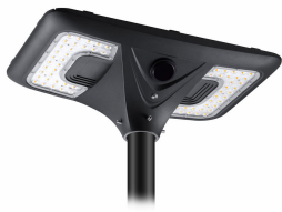
Solar All-in-one Post top