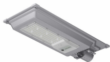
Solar Pathway Light