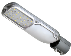
Product Detail Photo Coreline