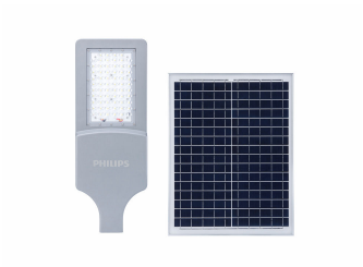
BRP216 G2 SOLAR