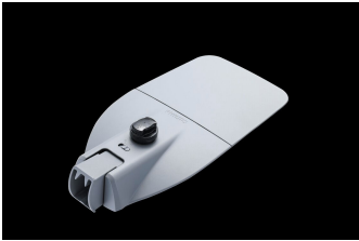
BRP47 side back