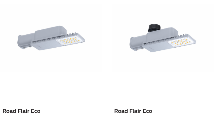
Road Flair Eco