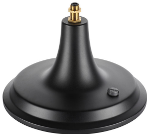
CityMood top socket view