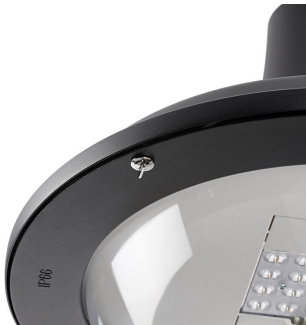
CityMood - toolless opening version