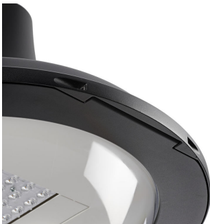
CityMood hinge view