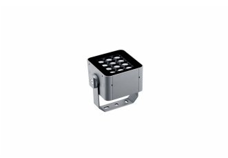
UniFlood M Gen2