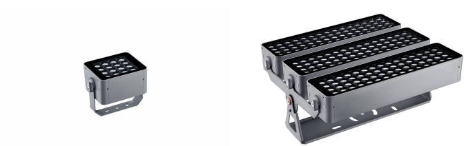
UniFlood M Gen2