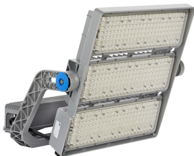
ArenaVision LED gen3 5