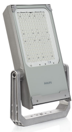
BVP656 Clearflood gen2 medium