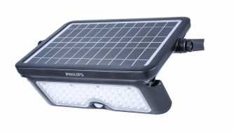
Essential SmartBright Solar Compact