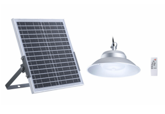
SmartBright Solar Lowbay