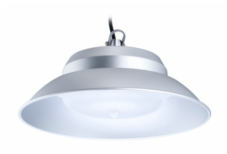
SmartBright Solar Lowbay