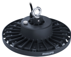
SmartBright Highbay G4