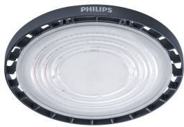
SmartBright Highbay G4