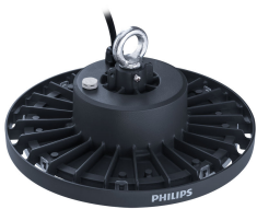
SmartBright Highbay G4