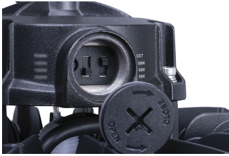
BY240P G2 Selector