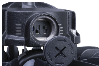
BY240P G2 Selector