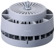
GreenUp Lowbay G2 BY288P Back