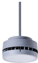
GreenUp Lowbay G2 BY288P