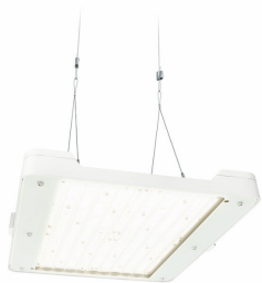
GentleSpace Gen3 BY481 WH