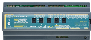
DDBC516FR 5 x 16A Signal Dimmer Controller front