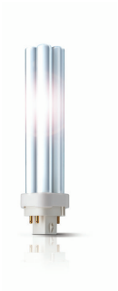
26 W 4 Pin Non integrated compact fluorescent - RFT