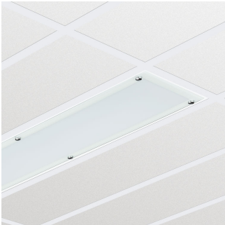
Cleanroom LED-CR250B W30L120