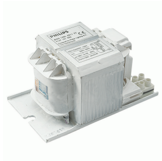
GPPR BCHPL1 0001