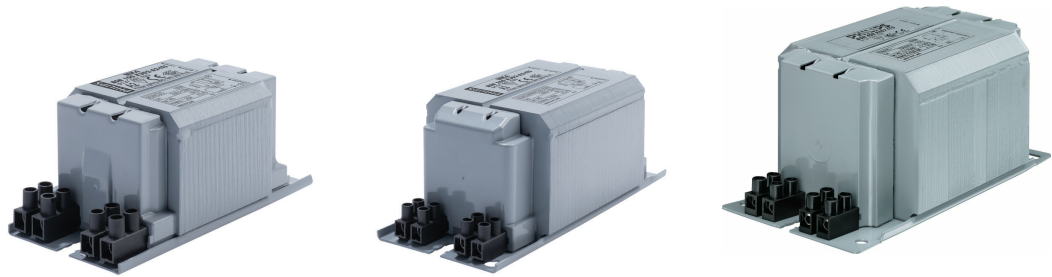
BSN 100 K302-A2-ITS 230V