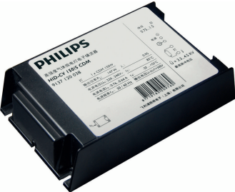
GPPR HID-CV1 0006