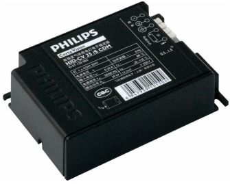
GPPR HID-CV1 0002