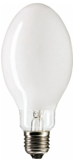
LPPR CDO-ET E27