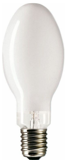
LPPR CDO-ET E40