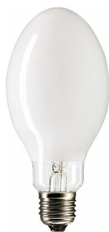
LPPR CDO-ET E27