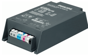
HID-DV DALI Prog Xt 150 CDO Q