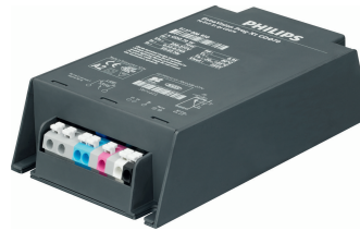
HID-DV DALI Prog Xt 50 & 70 CDO Q