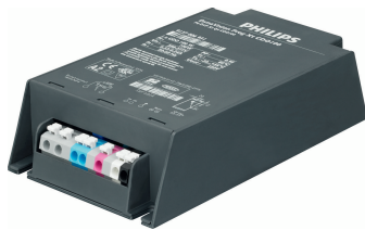
HID-DV DALI Prog Xt 100 CDO Q