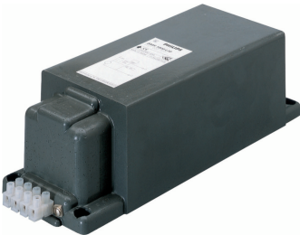
GPBR BSN-HP L02 L43 L78 PHL