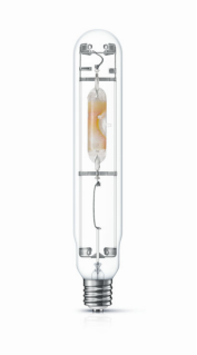
HPI-T 1000W E40