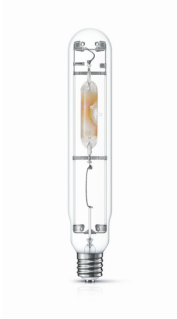
HPI-T 1000W E40