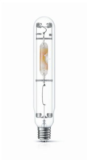
HPI-T 1000W E40