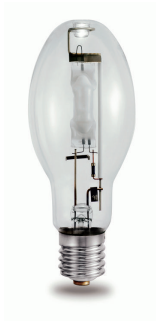
LPPR MH 0002