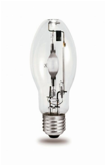
LPPR MH E26 E27 CL