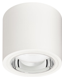
LuxSpace surface mounted-DN570C D250