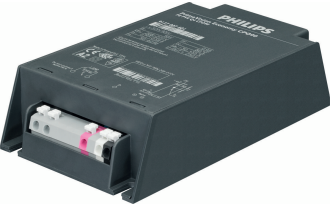
GPPR IPVECPO 0003