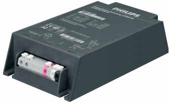
GPPR IPVECPO 0003