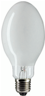
LPPR SON-I CO